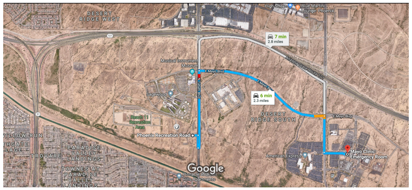
1000 ft